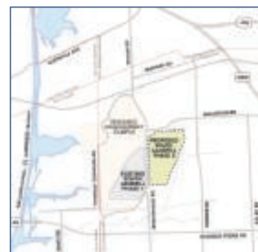
Shown: South Landfill

South Landfill (Phase 1), an essential component of Walker's integrated Resource Management Campus in Niagara Falls, is nearing its final capacity. Walker is proposing to develop the next phase to continue to provide safe, affordable, and reliable waste disposal services. Phase 2 will supply renewable energy to the community and will sustain over 500 jobs in the Region. As part of the Provincial planning process under the Environmental Assessment Act , Walker has initiated an environmental assessment. This study will assess the potential effects of the proposed landfill continuation on the environment and surrounding community to ensure Phase 2 can be safely developed.