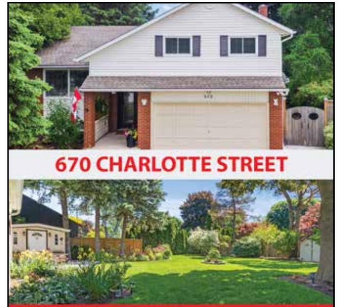
670 CHARLOTTE STREET

Charlotte Street is one of the nicest locations in the beautiful town of Niagara-On-The-Lake. The backyard is your private oasis with established trees and beautifully landscaped gardens and two sheds. The home is tastefully updated and decorated and move in ready! The main floor family room enjoys views of the gorgeous backyard and has a new gas fireplace to enjoy in the winter months. An additional large family room/rec room on the lower level allows for entertaining or a bright office space. Three spacious bedrooms and a primary ensuite. The home is a pleasure to show! Offered at $1,149,000.