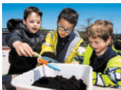
METROLAND FILE PHOTO

"I am exceptionally proud of the commitment our students and staff have to our shared responsibility for environmental stewardship," education director