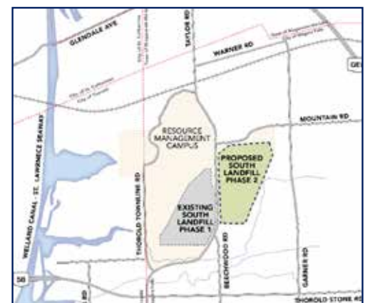
Shown: Location Map

The South Landfill, a key component of Walker’s fully integrated Resource Management Campus in Niagara Falls, is expected to reach its final disposal capacity between 2029 and 2031. Despite increased waste diversion, landfill space is still needed to manage materials that cannot be recycled and to accommodate future population growth. To continue to provide the Niagara region and surrounding communities with safe, affordable, and reliable waste disposal, Walker is proposing to develop the next phase (Phase 2) of its South Landfill. Phase 2 will provide an additional 18 million cubic meters of landfill capacity over a 20-year period, supply renewable energy for the community by turning landfill gas into energy, and continue to support over