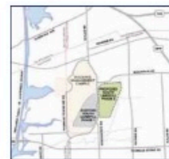
Shown: South Landfill

Engaging the local community and considering a range of perspectives is an important part of the planning process. Walker is seeking applications from members of the public to establish a South Landfill Phase 2 Environmental Assessment Advisory Committee to gather feedback, ideas, and local perspectives. This committee will play an important role in ensuring the next phase of the South Landfill considers a range of perspectives from the community.