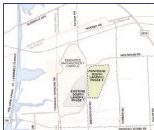
Shown: Location Map

The South Landfill, a key component of Walker's fully integrated Resource Management Campus in Niagara Falls, is expected to reach its final disposal capacity between 2029 and 2031. Despite increased waste diversion, landfill space is still needed to manage materials that cannot be recycled and to accommodate future population growth. To continue to provide the Niagara region and surrounding communities with safe, affordable, and reliable waste disposal, Walker is proposing to develop the next phase (Phase 2) of its South Landfill. Phase 2 will provide an additional 18 million cubic meters of landfill capacity over a 20-year period, supply renewable energy for the community by turning landfill gas into energy, and continue to support over 500 jobs in the Region.