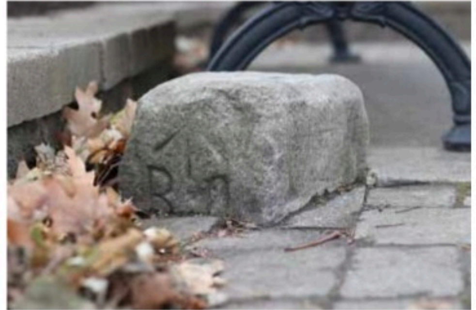
An ordnance boundary stone at the entrance of Simcoe Park. FILE

The six stones are located at Simcoe Park, the Charles