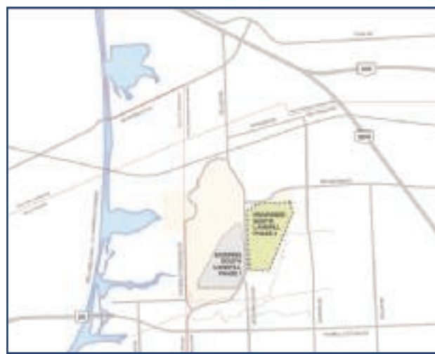
Shown: South Landfill

Club Italia, Grande Ballroom B, 2525 Montrose Rd, Niagara Falls