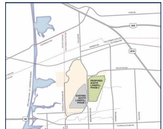
Shown: South Landfill

Members of the public, agencies, Indigenous communities and other interested persons are encouraged to actively participate in the planning process by attending consultation opportunities or contacting staff directly with comments or questions. Consultation opportunities are planned throughout the planning process and will be advertised in local newspapers, on the project website www.southlandfillphase2.com , by direct mail and/or electronic mail (email).